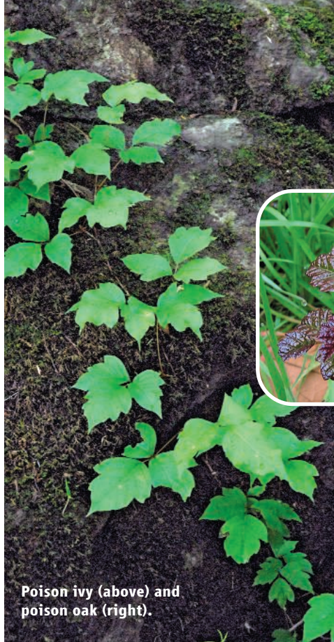
Poison ivy (above) and poison oak (right).